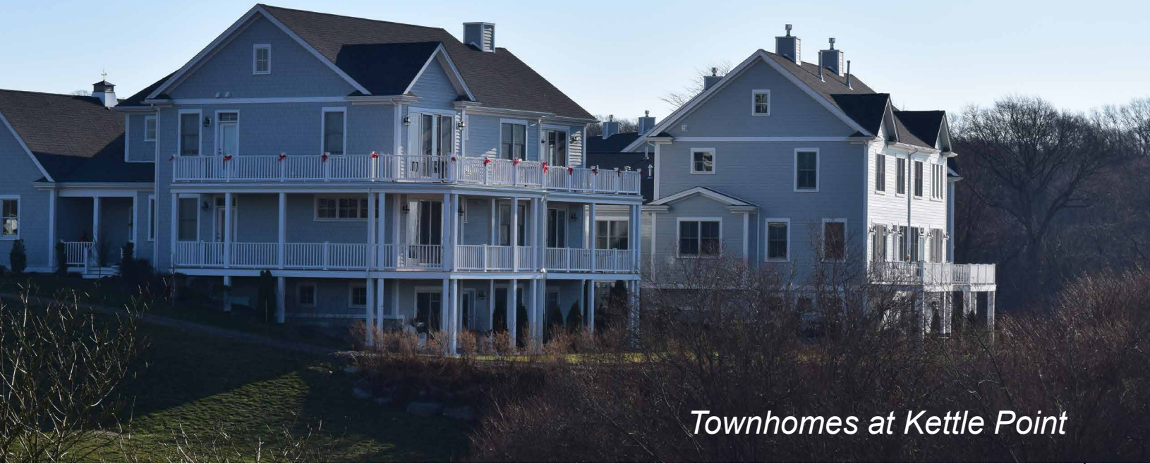
Townhomes at Kettle Point

The Kettle Point Townhomes, by AR Builders, were approved by the Commission in April of 2019. In February of 2020, approval was given to the final phase of apartments during the Commission's first virtual meeting. It enabled progress to proceed without delay.