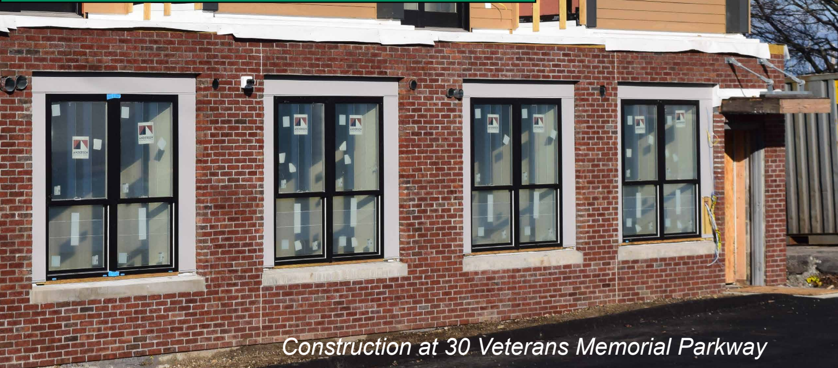
Construction at 30 Veterans Memorial Parkway