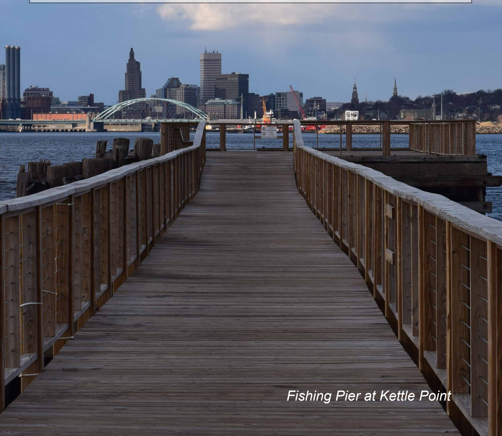
Fishing Pier at Kettle Point

Nearly 3 acres were donated by the developers of Kettle Point to the City of East Providence. The parcel includes public access to a 600 foot board walk and fishing pier. The pier is accessible by the Urban Coastal Greenway within Kettle Point.