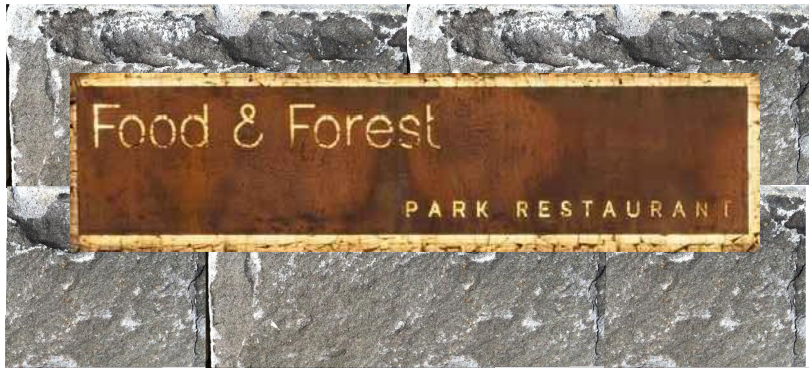
BACKLIT CUT STEEL SIGNAGE EXAMPLE IMAGE (NATURAL PATINA RAW STEEL, CUT AND SET 6" FROM GRANITE BLOCK BASE)

(SHOWN FOR CONCEPTUAL ARCHITECTURAL STYLE AND CHARACTER)