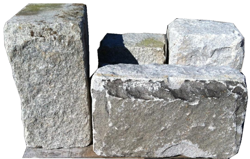
RECLAIMED GRANITE BLOCKS AT ENTRY SIGNAGE

(SHOWN FOR CONCEPTUAL ARCHITECTURAL STYLE AND CHARACTER)